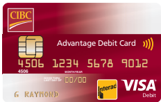
CIBC Advantage Debit Card