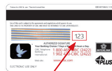
Three-digit Security Code

Tip: If your card does not have a name on the front, use your legal first and last names.