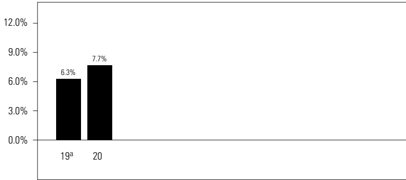
Series T5 Units

a 2019 return is for the period from February 4, 2019 to December 31, 2019.