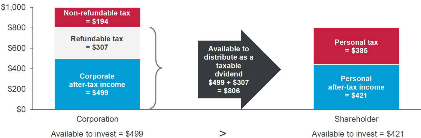
Figure 1: Interest income earned in a corporation in Ontario

The left bar of Figure 1 shows that non-refundable (federal and Ontario) tax of $194 and refundable tax of $307 would be paid by your corporation when the income was initially earned, leaving $499 available within your corporation for investment. When a taxable dividend is paid, the refundable tax would be returned to your corporation, so that a total of $806 could be distributed to you as a taxable dividend. The right bar of Figure 1 shows that you would pay tax of $385, thus leaving $421 in your hands for investment.