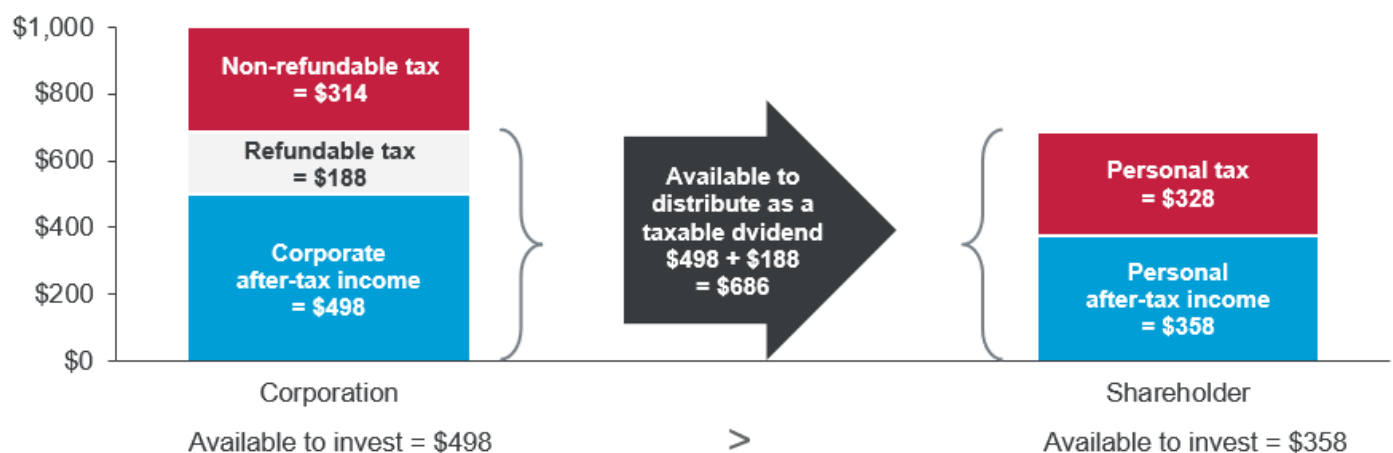
Figure 4: US dividends earned in a corporation in Ontario

The left bar of Figure 4 shows that non-refundable (federal and Ontario) tax of $314 and refundable tax of $188 would be paid by your corporation when the income was initially earned, leaving $498 available within your corporation for investment. When a taxable dividend is paid, the refundable tax would be returned to your corporation, so that a total of $686 could be distributed to you as a taxable dividend. The right bar of Figure 4 shows that you would pay tax of $328, thus leaving $358 in your hands for investment.