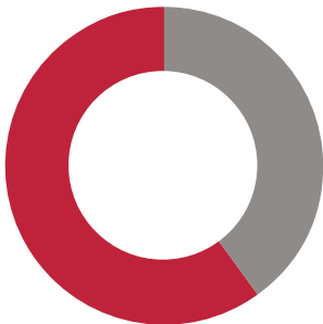
Canadian Core Pool

■ Canadian fixed income ■ Canadian equities