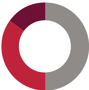
North American Yield Pool

■ Canadian fixed income ■ Canadian equities ■ U.S. equities