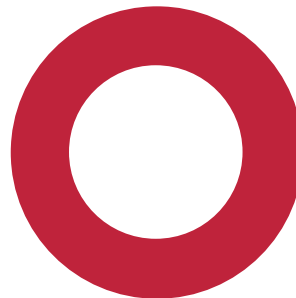
Canadian Core Equity Pool